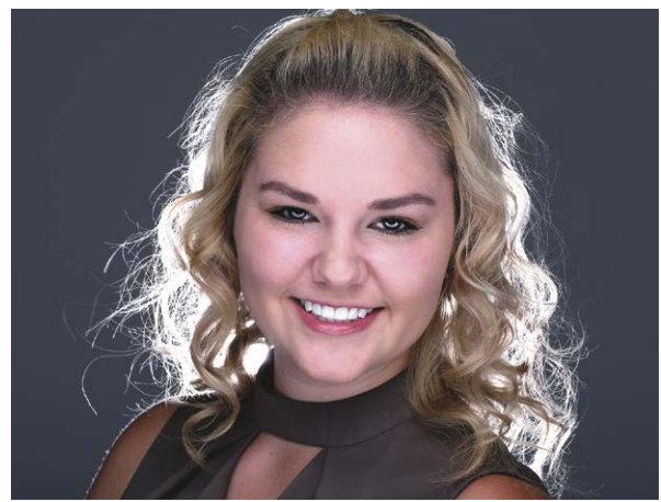
Figure 12: Happy patient with her beautiful new smile.