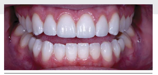
Figure 10: Postoperative retracted view (1:2) showing nice anatomical form and even gingival contour.