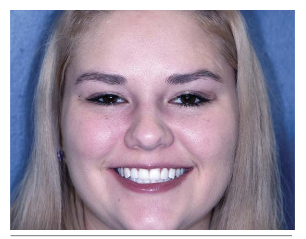
Figure 11: Postoperative portrait view.