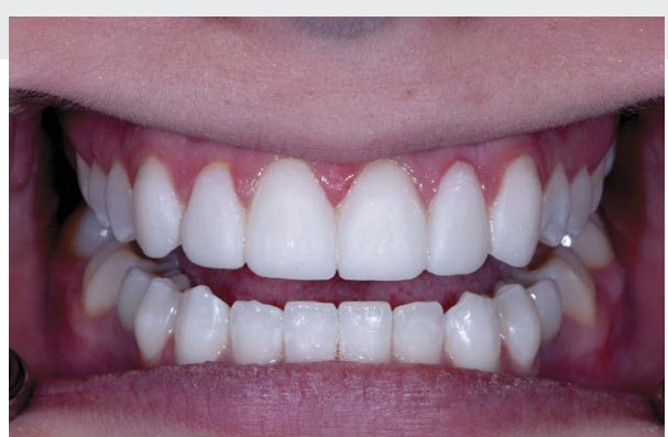
Figure 7: Retracted frontal view (1:2) of the temporary restorations, displaying well-fitting margins and symmetrical gingival contours.

The gingival heights of the maxillary anterior teeth (#6-#11) were even and in a straight pattern, with the exception of the left lateral incisor (#10). The tissue height of #10 was too low and lacked symmetry with the tissue height of #7 (Fig 4). Bone sounding was completed, and it was determined that the distance from the gingival height to the bone crest on #10 was approximately 3.5 to 4.0 mm. To obtain symmetry with the gingival heights of #7 and #10, it was determined that minor closed-flap osseous recontouring would be necessary.<sup>6</sup>