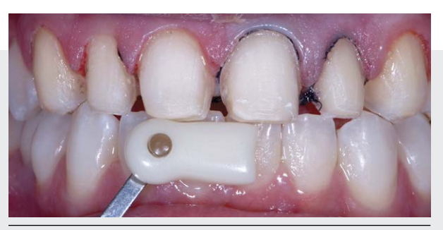
Figure 5: Preparation design, stump shade selection, and cord packed ready for the impression.