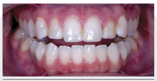
Figure 4: The level of the gingival height can be evaluated in the preoperative retracted view (1:2).