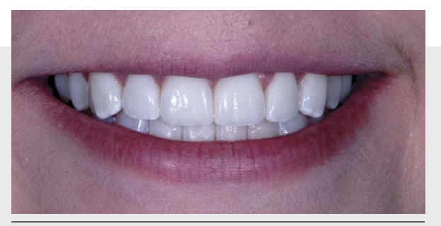
Figure 9: Postoperative smile view (1:2) showing excellent symmetry and color match.

Tooth preparation for bonding: The teeth were prepared for bonding as follows: