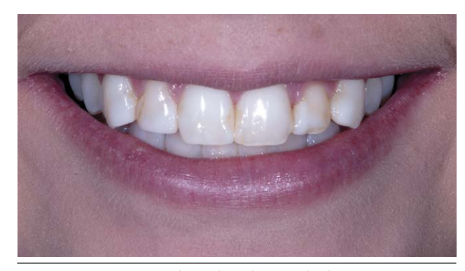
Figure 3: Preoperative frontal smile view (1:2).

the mandible was then evaluated to ensure that there would be no functional concerns with the new restorations.4 Clinically, the mandibular anterior teeth showed no visible signs of wear, with mamelons present. No joint pain or pathology was noted. The patient's bite felt comfortable, with simultaneous bilateral contacts on the posterior teeth. There were no signs of any functional or parafunctional bite issues, so the current position of the teeth in the mandible was not a concern.5