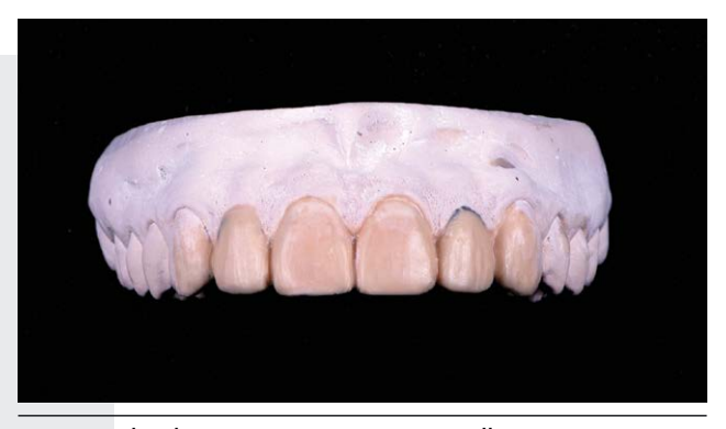
Figure 1: The diagnostic wax-up is an excellent way to communicate with the lab technician regarding the restorations' desired contour and anatomy.

The posterior teeth fit well with the patient's lip line and filled out the buccal corridor nicely, so they did not need to be restored. With the position of the maxillary arch established,