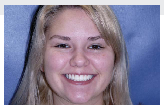
Figure 6: The temporary restorations helped give the patient an opportunity to "test drive" her new smile.