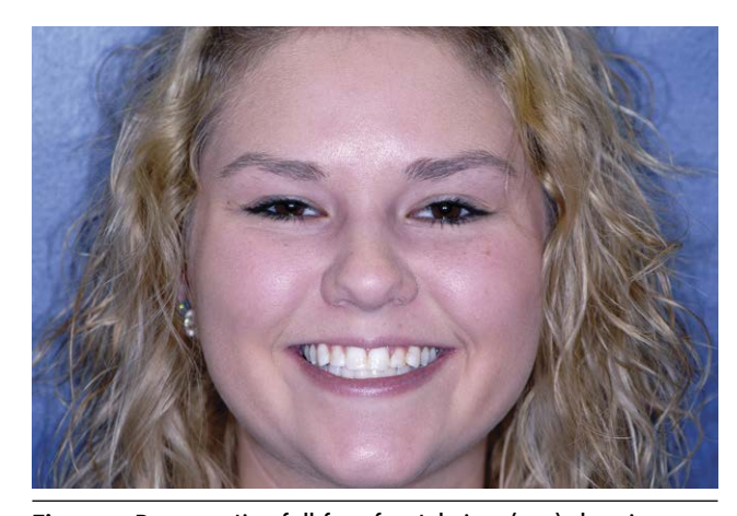
Figure 2: Preoperative full-face frontal view (1:10) showing uneven and discolored bonding.